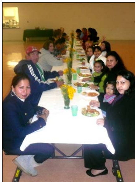
Nicasio School’s Spanish-speaking families were hosted to an evening of dinner and discussion with school staff on November 18 th.

For details about these important steps, contact your nearest fifth grader , or call (415) 485-3131 or visit www.getreadymarin.org .