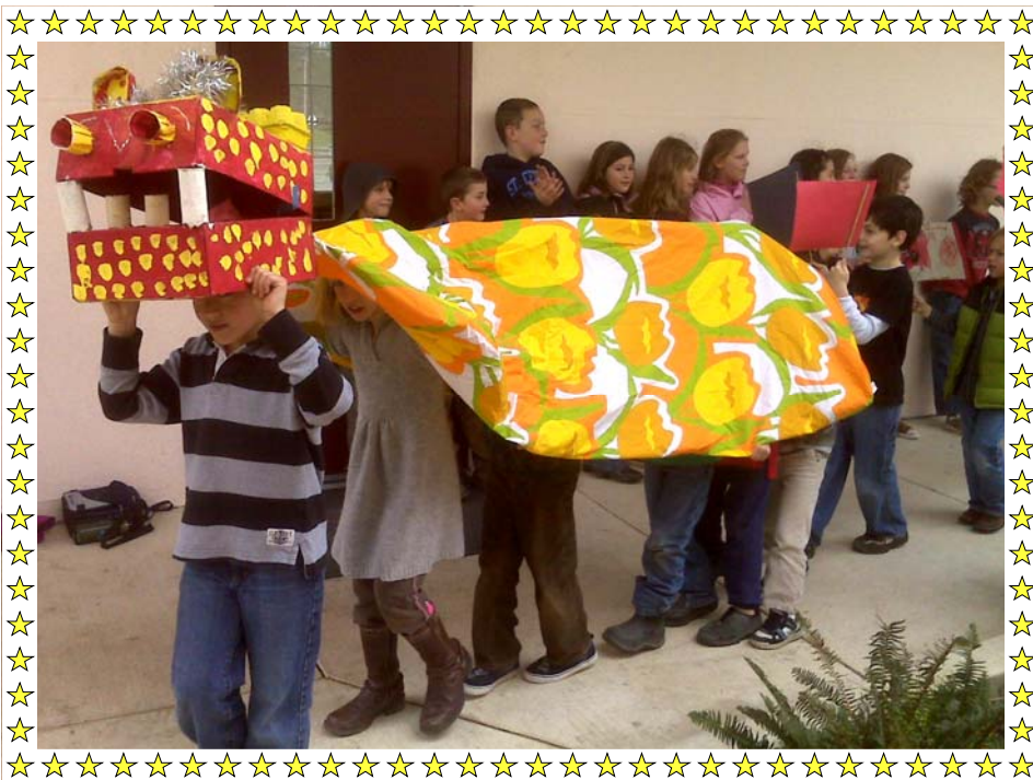
The K-1-2 students lead the school in a celebration of The Year of the Tiger . The K-1-2 class also created special Chinese New Year flags which were proudly displayed in the office.