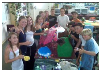
Middle school class prepares volcano for an "eruptive" demonstration at school assembly.

A volcanic eruption caused shock waves of glee during a school assembly led by Mr. W. and his Grade 6/7/8 class on Sept. 23rd.