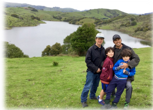
The Dixon-Perdomo family gets some fresh air and recreation time together.