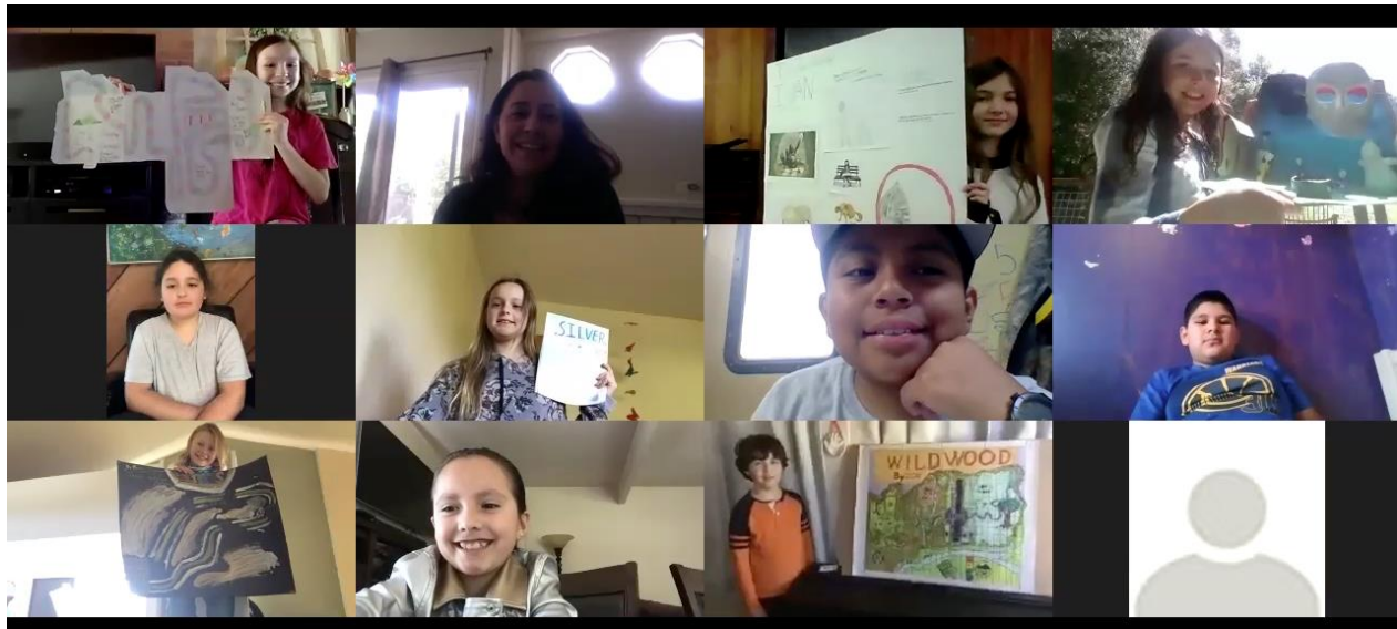
Gr. 3-4-5 students proudly share their AR projects with their classmates this week.